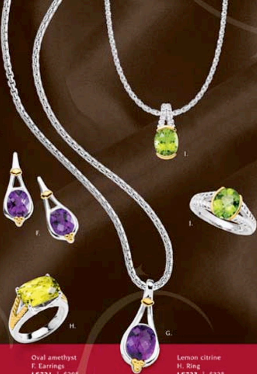
Oval amethyst F. Earrings LS721 | $295 G. Pendant LS722 | $350