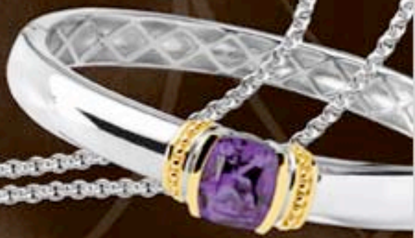
L. Amethyst bangle bracelet LS713 | $550